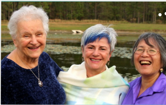
Past HTWF Presidents