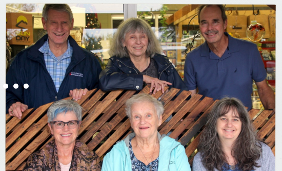
2019 HTWF Annual Meeting