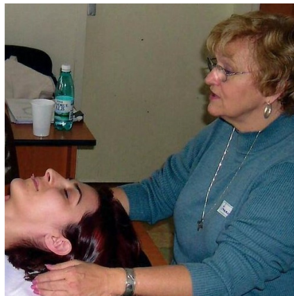
2005 - Teaching a Level I class in Romania.