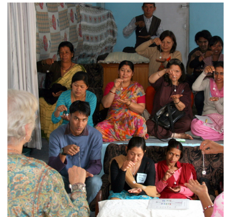
2010- Teaching a Level I class in Nepal.