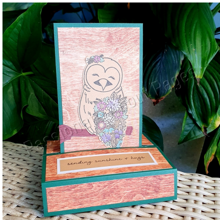
Z5024 Adhesive tape