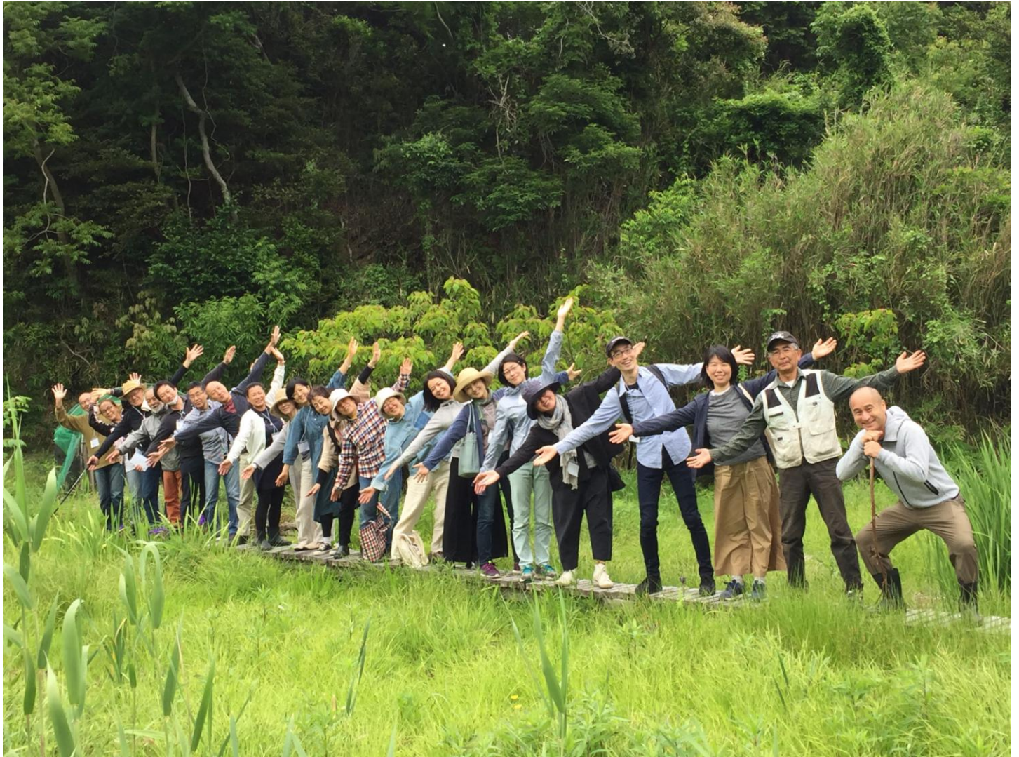
Urban Reforestation / As One Network Suzuka Community. May, 2019

They observed how to maintain the wetland and woodland hiking along the wooden path.