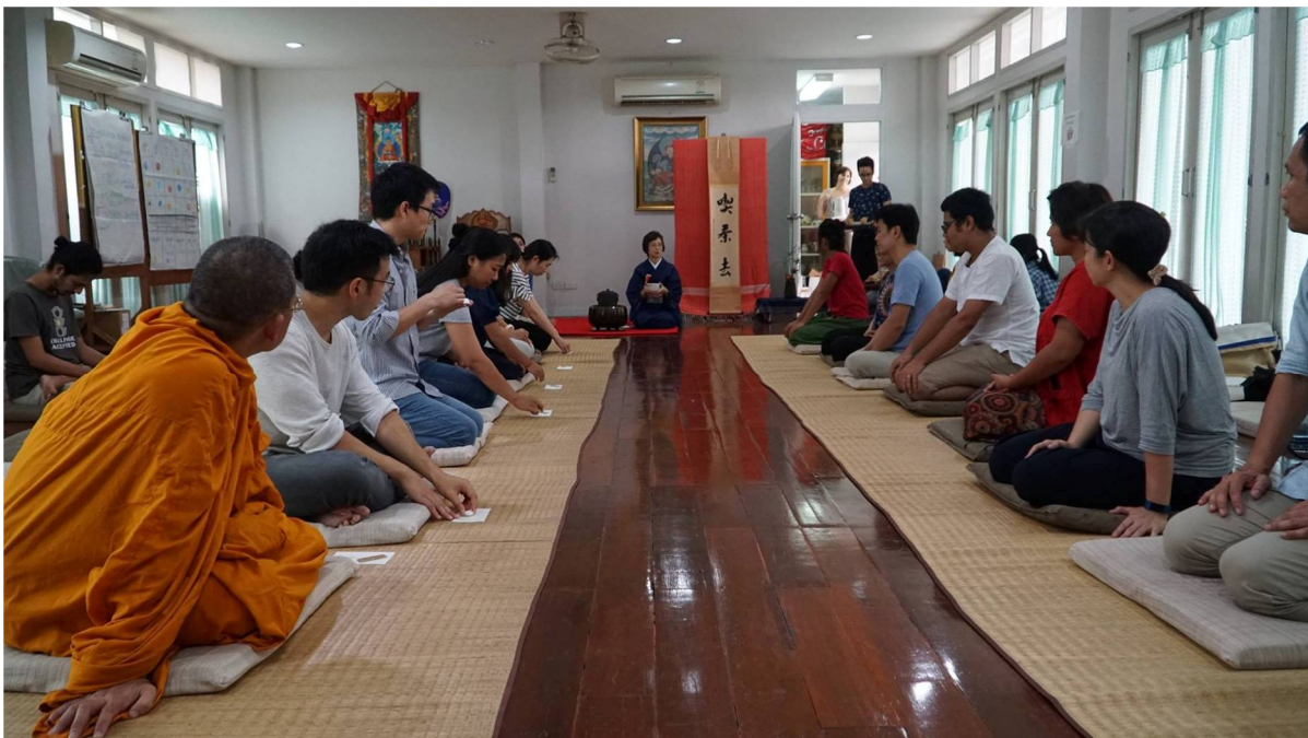
Japanese tea ceremony part of Slow is Beautiful module

The first module tried to show a new way of looking at the world: from valuing bigger, faster, and more to experiencing the benefits of living slow, small, and simple. By giving attention to culture (also by rediscovering its practices) and understanding of the economic mindset, participants could critically assess the downfalls of limitless growth and start thinking differently about progress, by seeing a new vision of well-being - an important lesson for anyone aiming to live a full life.