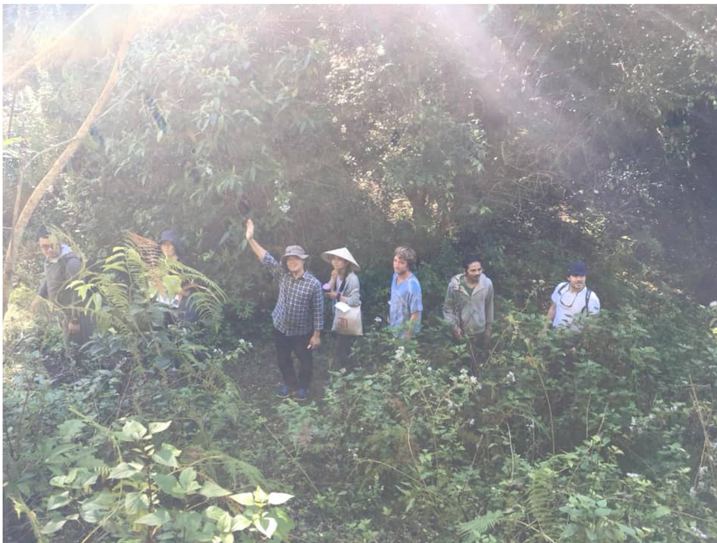
Exploring the magical forests in the lands of indigenous Karen community in Northern Thailand

There were four modules on ecology: Foundations in Ecology, Ecological Crises, Deep Ecology and Ecological Design. The one-month dimension took place in an indigenous Karen community in N Thailand, where participants stayed with families, and took part in community livelihood activities during the days off. It was a fully integrative experience, following the rhythms and interacting with the daily life in a traditional community. This whole experience deepened all aspects of the study, bringing in the unique worldview of Karen people and their relationships with the environment. This brought a rich ecological learning dimension to participants through connecting to the daily-lived experience and worldview of the community members, and being exposed to other ways of connecting with nature - specifically through natural science, ecological design, and deep ecology practices.