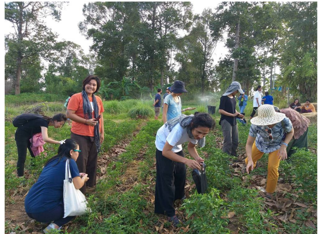
Hands on work: Integrating into community life wherever they arrive