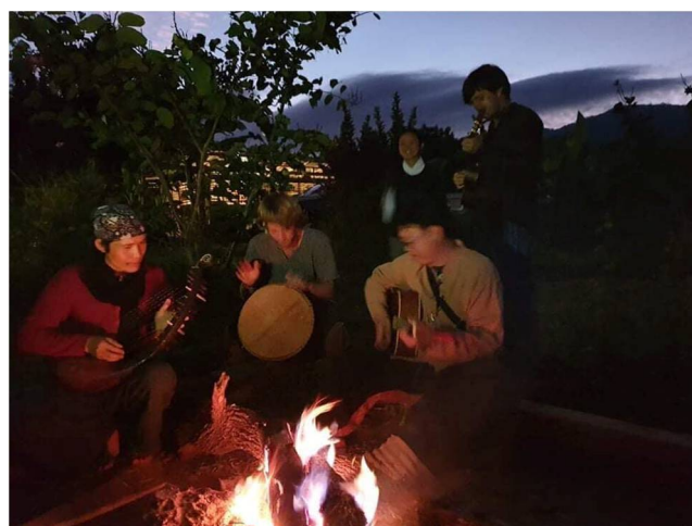
Sometimes the time called for celebration

The long-term group of students (with the 5 EDE participants at its core) were given space to practice and experiment with self-governance. They were handed responsibilities such as organising Hands-on work, writing up reflective articles for posting on social media, and welcoming new students to ensure a sense of community and trust continued throughout the timeframe of the programme. Having space for decision making and taking responsibility strengthened their own skills in social dynamics.