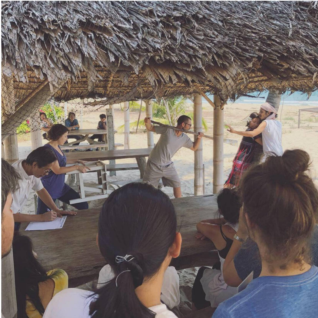
Taking part in community theatre during Applied Drama module