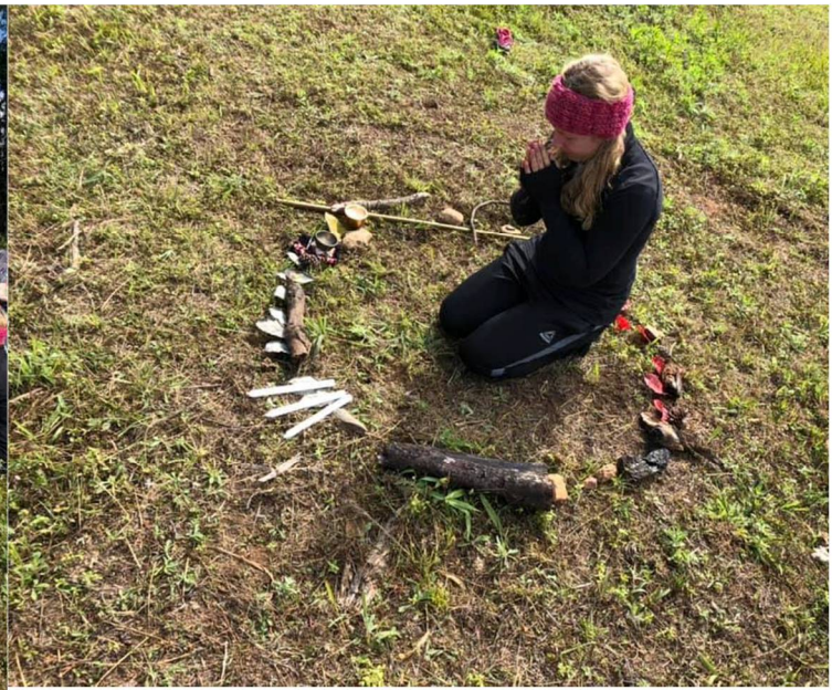
Vision Quest: Looking to nature for guidance, and bringing its gifts back to the community

I feel more trust, more confident and braver, the Vision Quest has been very important for me on this level. I developed compassion for people, even for people that struggle with me or I struggle with. And I love everyone equally, which is equanimity. I strengthened my commitment for the earth, for the needed changes in the world, which is something quite dear to me. I have new ways of seeing the world, due to all the different perspectives from participants, and of the planet, that I experienced.