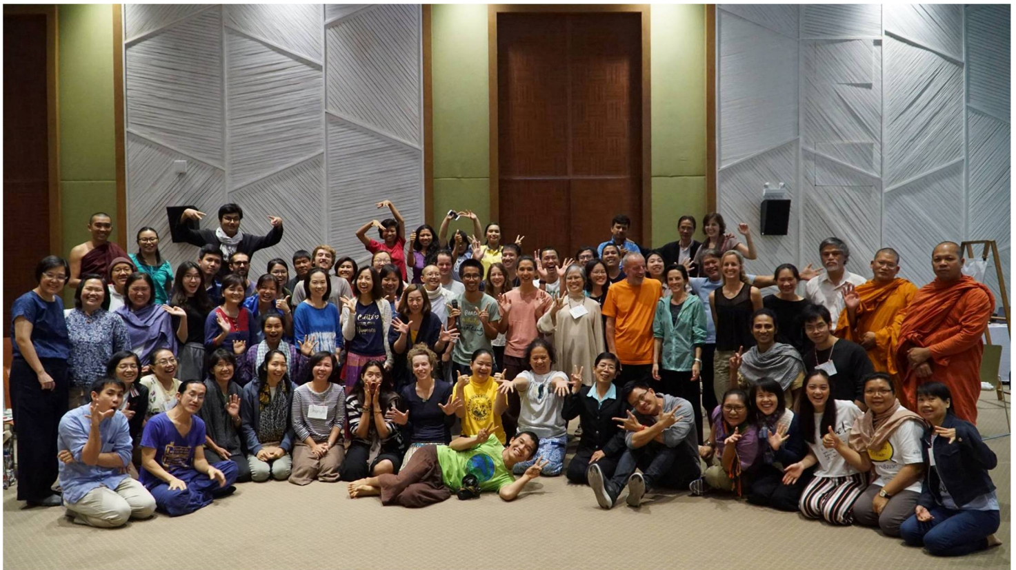
Participants attending the Deep Democracy module

While 5 participants completed the whole course, over 150 participants joined at least one module of learning. The programme aligned with a parallel Thai Awakening Leadership program, and participants from both programmes coalesced during certain modules of learning, for greater interaction and diversity among the learning community. As well as co-learning with Thai participants, there was also a significant group of Chinese participants joining the ecological modules, and Myanmar participants joining throughout the programme. While many participants are active in the social realm in differing capacities (lawyers, trainers/facilitators, NGO workers, environmental educators etc.), there was also number of participants seeking direction in how to walk their path with sustainability and authenticity at its core (business sector, school teachers). Another significant group of participants were grassroots actors, working directly with marginalized communities across the Asian region.