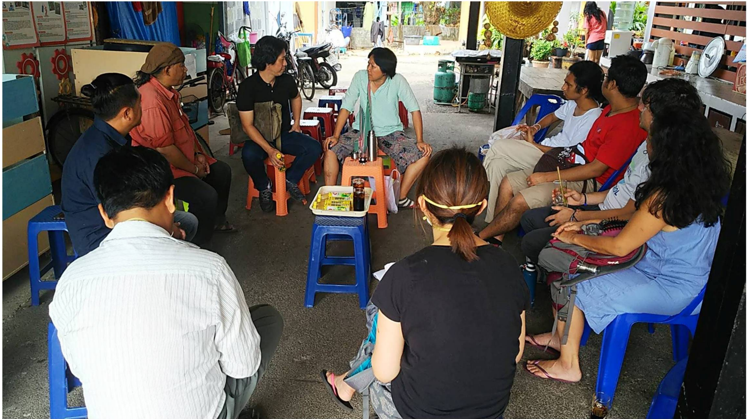
Learning about community organising in practice

We started off the dimension with Cultural Repair, a module which introduced different ways of restoring interconnection and healing with ourselves, our communities, and the natural world using systematic processes of adding back in lost, forgotten, or undervalued traditional cultural elements. Immediately following, Sociocracy presented a model for both decision-making and governance. Within a limited timeframe of three days, participants received practical skills, and effective tools, using interactive small group activities, and role-play examples in order to gain practical experience.