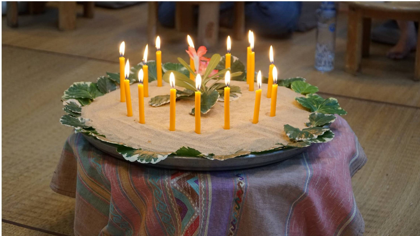
Candles lit by participants during the inauguration ceremony

Over the timeframe, participants took a journey grounded in critical self-awareness. Different forms of mindfulness and reflection were embedded into the daily rhythms of the programme. From this they learnt to be present, to understand themselves as a way to understand others and vice versa, and they gained the confidence and courage to find their way forward. They got to spend time in nature, to explore inner healing, and practice diverse forms of inner inquiry. This all helped to bring awareness to a sense of interconnectedness, and a commitment to contribute to the wellbeing of our world.