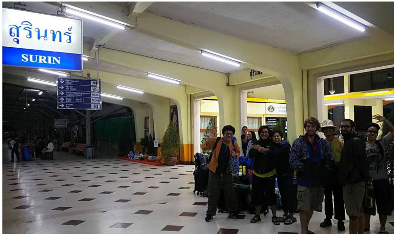
Participants arriving to Northern Thailand after a night on the train

Local Solutions encompassed an exposure visit to some interesting and powerful examples of community organizing and self-governance across the NE of Thailand. Setting out to explore whether alternative ways of living and governing were possible and to meet pioneers in praxis, beginning with the 'community' as society's foundational unit. It included visits to examples of community economy models, holistic community development, spiritual community and intentional community living. A lot of inspiration was felt through learning directly from these communities, their lessons learned over decades of action, and the pioneers who had committed their lives to putting into action their values and visions for a better society.