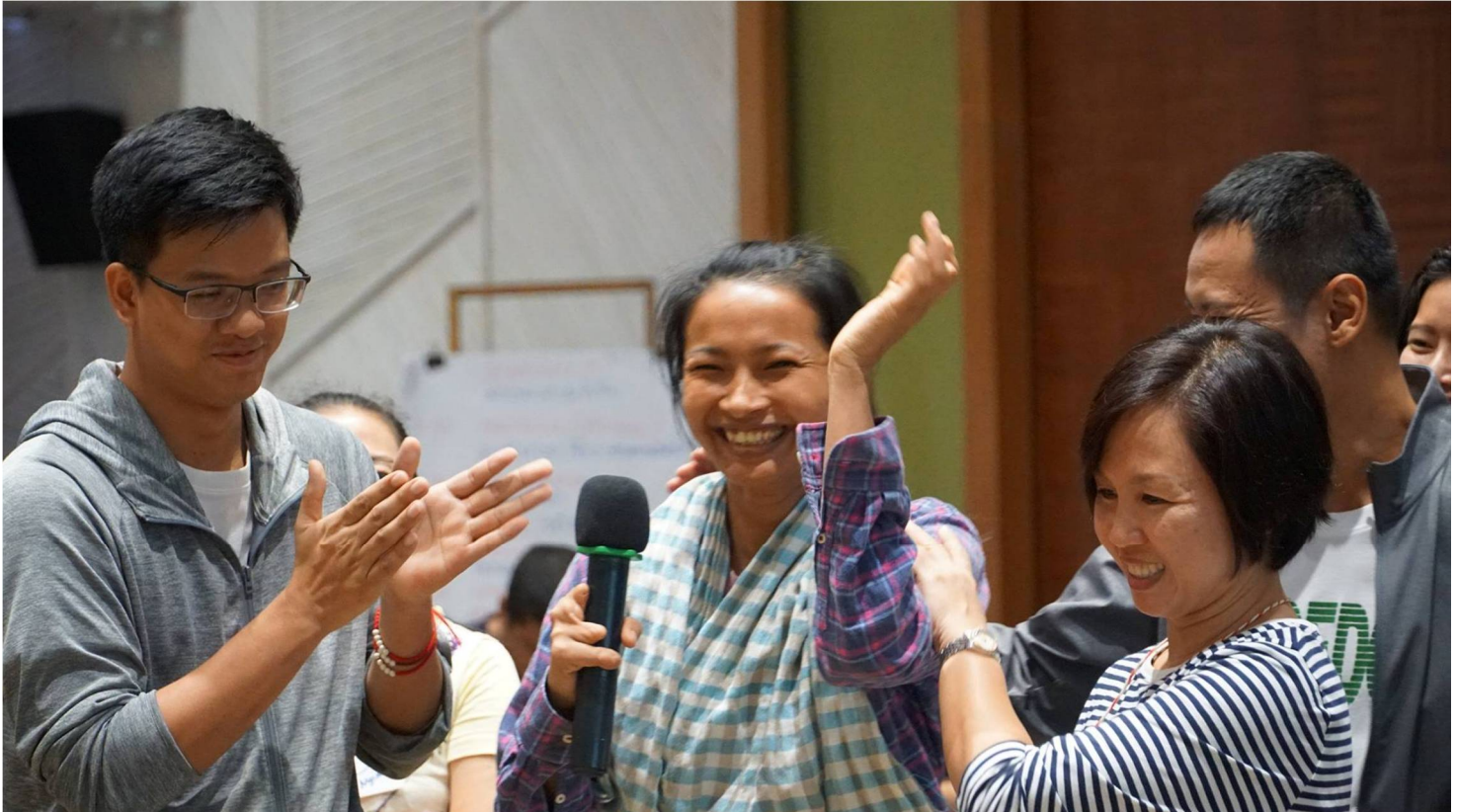
Gaining confidence during a group Deep Democracy process