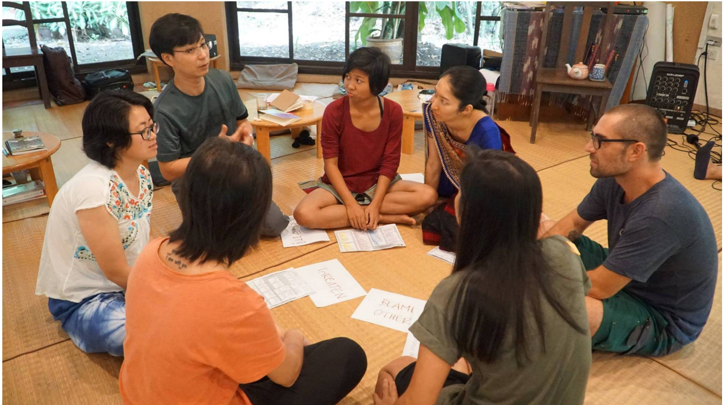
Student council meetings as part of participants' experimentation with self-governance

A significant portion of the course was spent at Wongsanit Ashram, an intentional community and ecological training space that has hosted EDE trainings since 2008. One month was spent in an indigenous Karen community in N Thailand, where participants stayed with families and ate together with them. Some participants also joined their daily livelihood activities on free days, which included rice cultivation and market gardening. The final parts of the training included exposure visits in S Thailand, including homestay with local communities, deepening learning experiences through sharing daily lived reality of people and having the space for dialogue and sharing together.