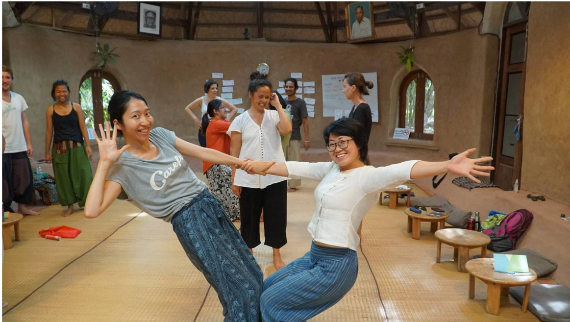
Building trust and foundations for a community of good friends

own perspectives, and utilise that as a basis to explore further learning in and outside the classroom.