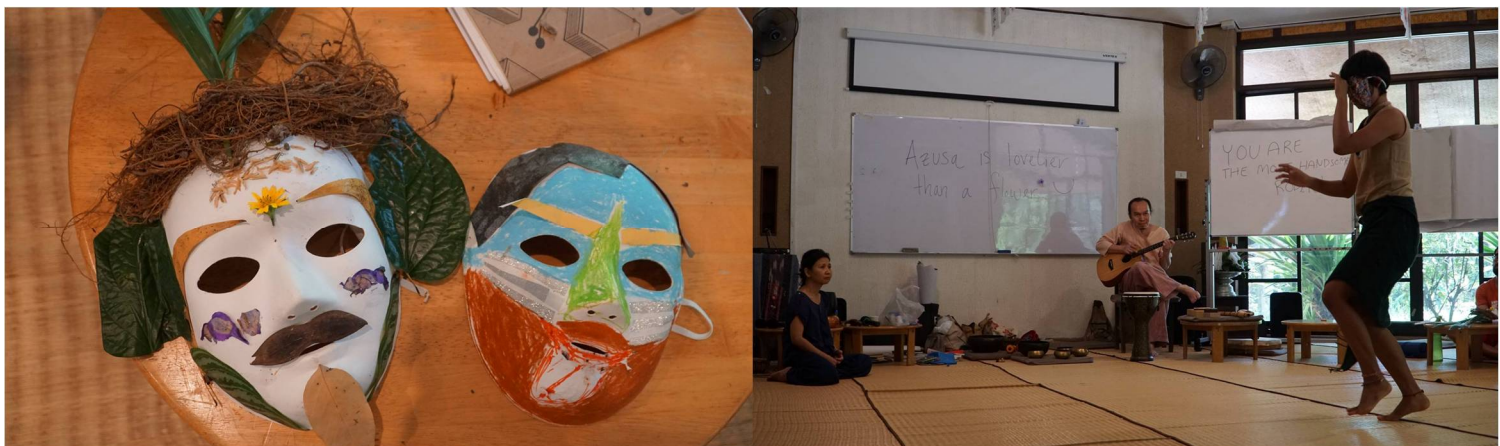
Masks: Participants exploring different parts of their personality during Art and Self-Discovery

The final 3 modules focused on self discovery and transformation of consciousness through mindfulness and trauma healing, with each modules' experience building onto the next one, allowing for deeply transformative processes within the learning space to open up. These modules also provided different pathways into self-exploration, so that participants could experiment, explore different ways of knowing, and acknowledge the different aspects of themselves as they were revealed. This flow of modules was most powerful in terms of inner transformation, and participants continued with some of the practices as a group and individually over the remainder of the program.