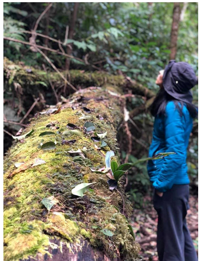
Being with nature, learning from nature