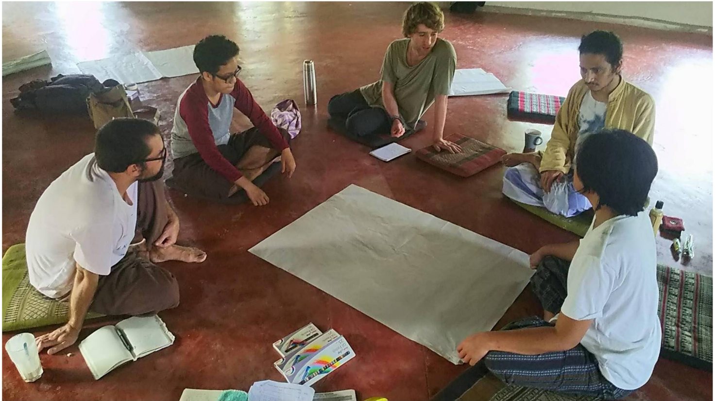
Dimension wrap up following the last module of each dimension