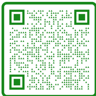
Scan to Donate Today!

Check out CCA's Amazon Wishlist by scanning the QR below. Our teachers add items throughout the year and would appreciate any support in donating items to their classroom!